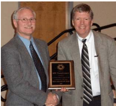
MTC Transformers receives the Joint IDA’s Special Recognition Award for 2009.

The Joint IDA presented its Special Recognition Award to MTC Transformers at the Wytheville-Wythe-Bland Chamber of Commerce annual dinner on November 16. The award recognizes MTC’s contributions to the local community. In existence since the mid-1980s, MTC has seen dramatic growth over the last 10 years. The company moved to its current 80,000 SF facility in 2001. In both 2008 and 2009, MTC Transformers was named to the Virginia Chamber of Commerce “Fantastic 50” list of the fastest growing companies in the Commonwealth, the only manufacturing company on the list in 2009.