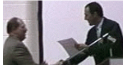
Joint IDA presents award.

The 2001 Beautification Award was presented to Crisp Manufacturing in recognition of landscaping and other efforts to enhance the external appearance of the company's facility in Rural Retreat. Wytheville Technologies, Inc., was welcomed and recognized as the newest member of our industrial community. A special award was presented to Bland County for its crucial role in the formation and initial Participation Project of the Crossroads Regional Industrial Facility Authority. Wytheville Technologies, Inc., was the first revenue sharing project among local jurisdictions under the Virginia Industrial Facilities Act. Wythe County and Wytheville were also recognized for their participation in the Crossroads Industrial Facility Authority.